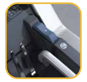
Electric punching for ultimate ease of use