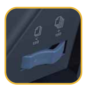
Back margin adjustment selector for various sheet sizes